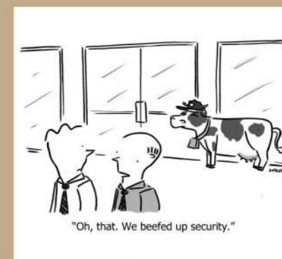
"Oh, that. We beefed up security."